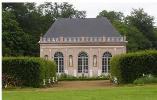
Orangerie de La Moglais