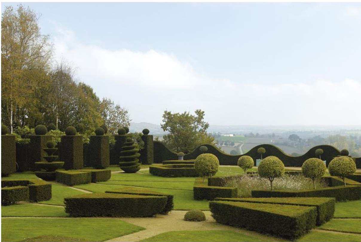
Jardins de La Ballue