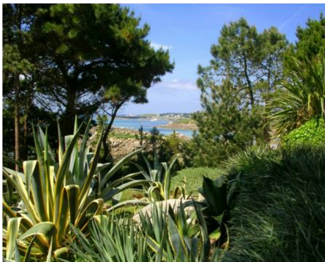
Jardin Georges Delaselle—Ile de Batz