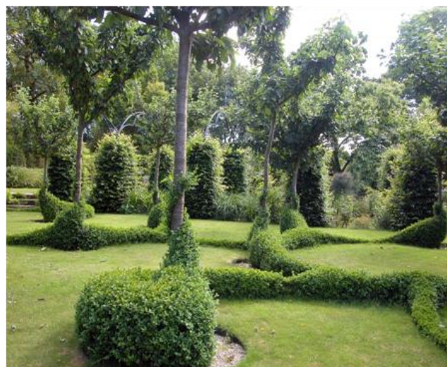
Le Grand Launay