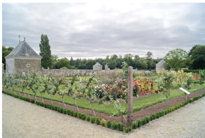
Potager de La Bourbansais