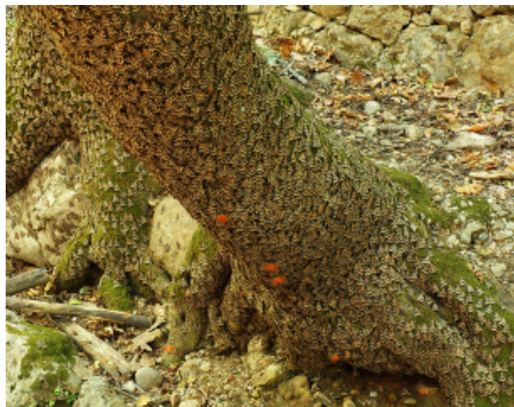
The nocturnal moth (Panaxia Quadripunctaria)