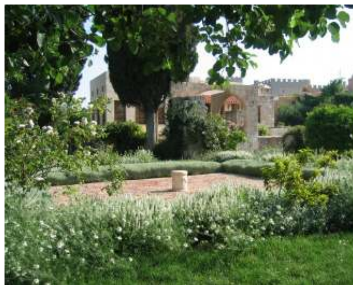
Garden of Marc de Montalembert Foundation