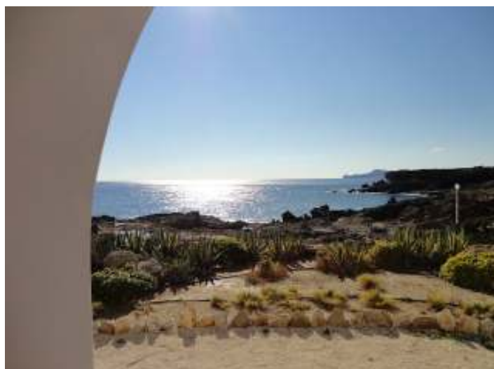
Kallithea Springs and Garden