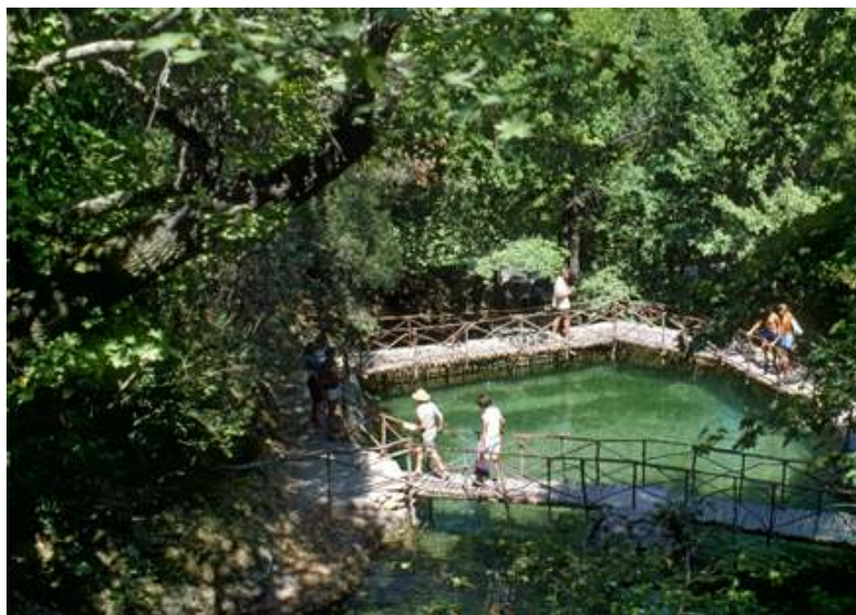
Valley of Butterflies