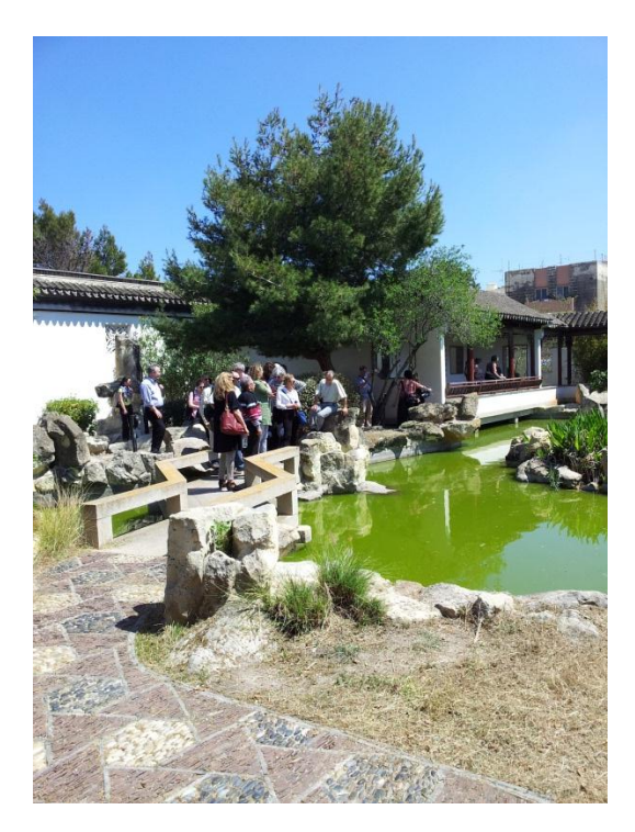
Atelier Session 2: Paola – Garden of Serenity Santa Lucija