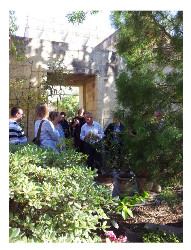
Atelier Tour: Botanical Gardens Floriana