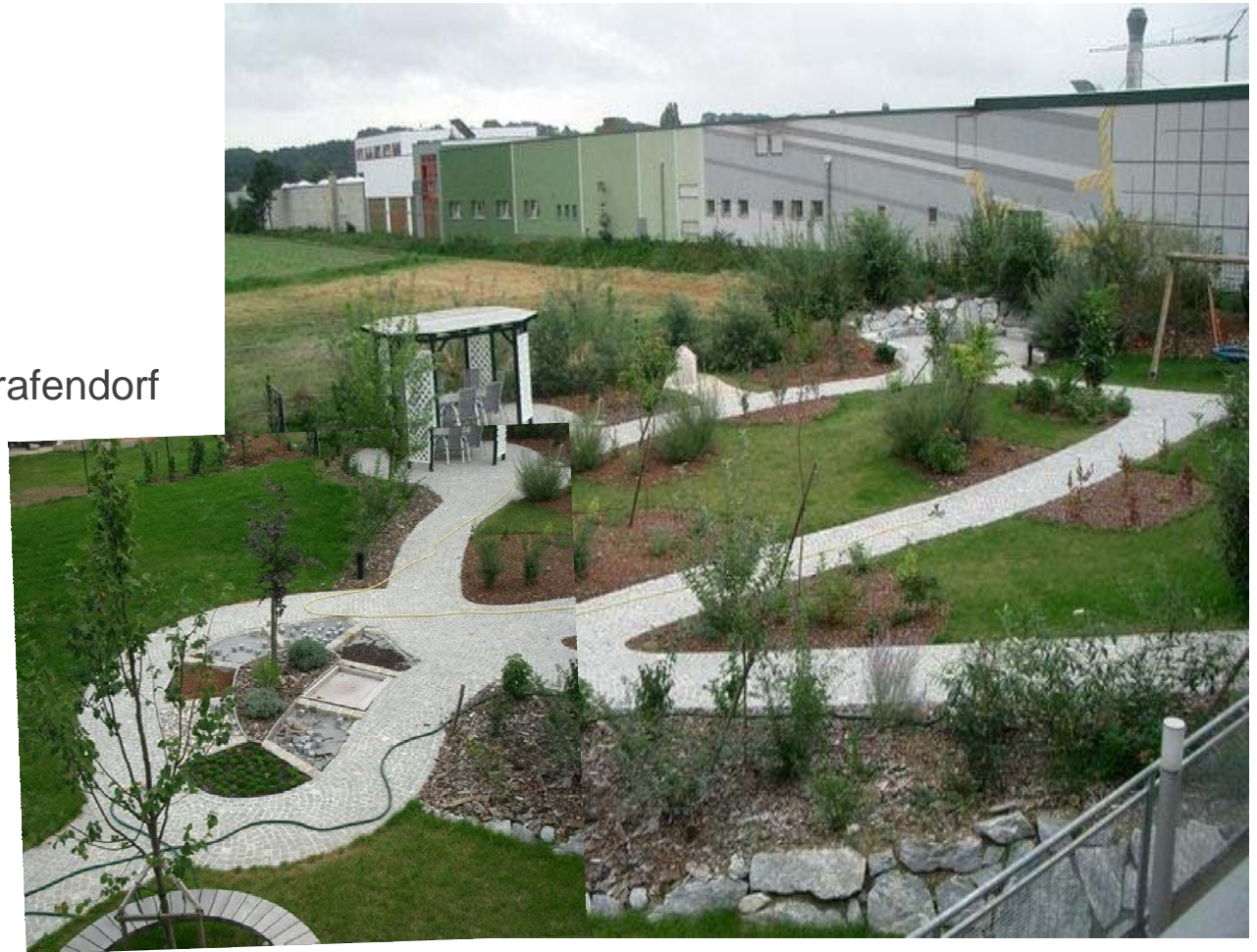
Overview Garden Obergrafendorf

www.garten-therapie.de/carits_behinderten_tagesheim_obergrafendorf.html